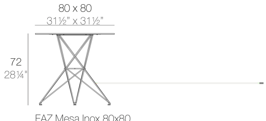
FAZ Mesa Inox 80x80 FAZ Dinning Table Stainless Base 31½"x 27½"