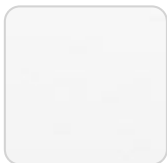
white (white edge)