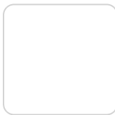
white wood 2