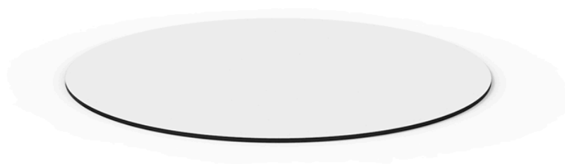
Table top ø100 hpl 10 mm