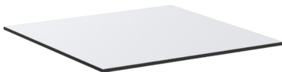
Table top 59x59 hpl 10 mm