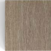
Weathered Teak 9004