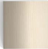
Wood 2 9002