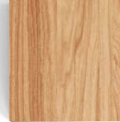
Natural Teak 9003