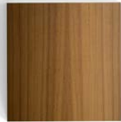
Wood 1 9001