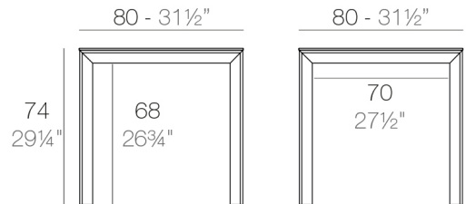
FRAME Mesa 80x80cm FRAME Dining Table 31½"x31½"