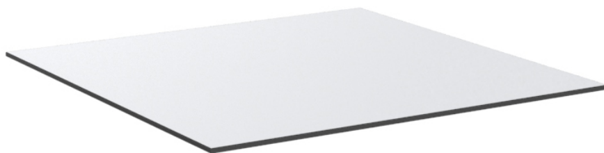
Table top 89x89 hpl 10 mm